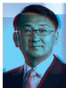
Adjunct Professor at Georgetown University Law Center