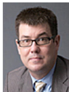
Professor of Law at Georgetown University Law Center